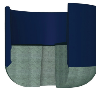
320 - Guide Shoe with Concrete Nose